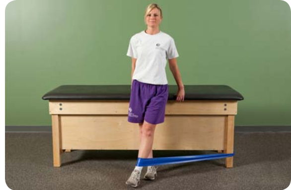
Standing theraband/pulley weight – Adduction