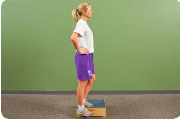
Step-ups with eccentric lowering