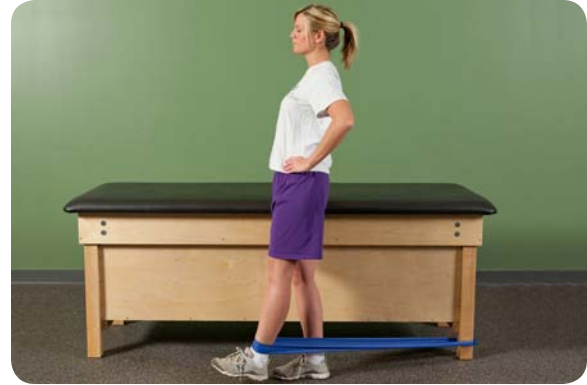
Theraband resistance on affected side – Flexion (start very low resistance)