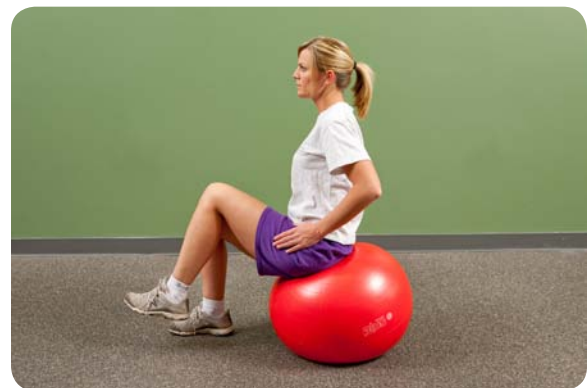
Seated physioball progression – hip flexion