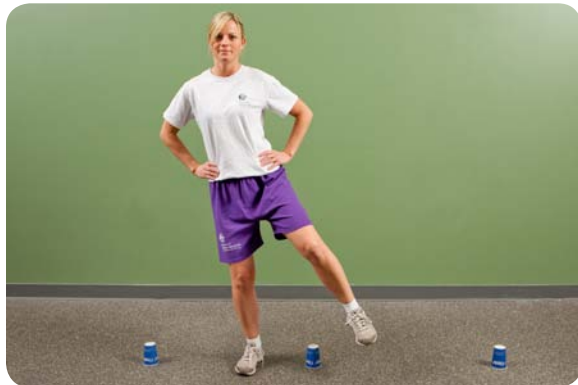
Lateral walking over cups and hurdles (pause on affected limb), add ball toss while walking