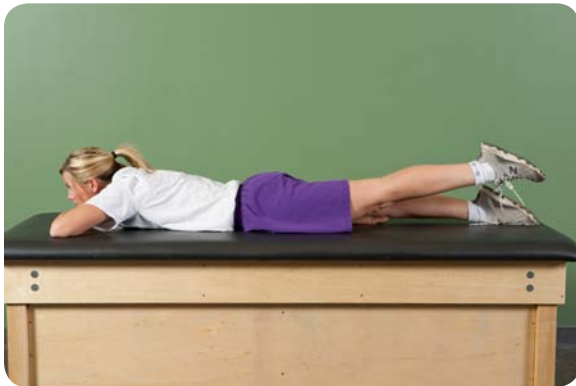
Leg raise – Extension