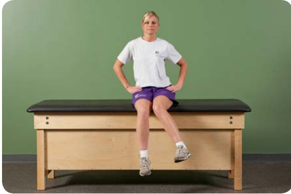
Seated weight shifts, lateral