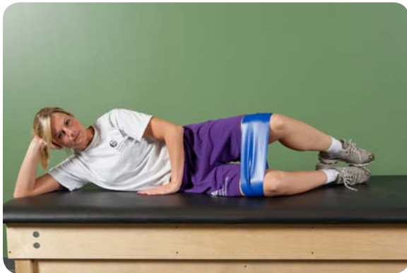
Clamshells with theraband