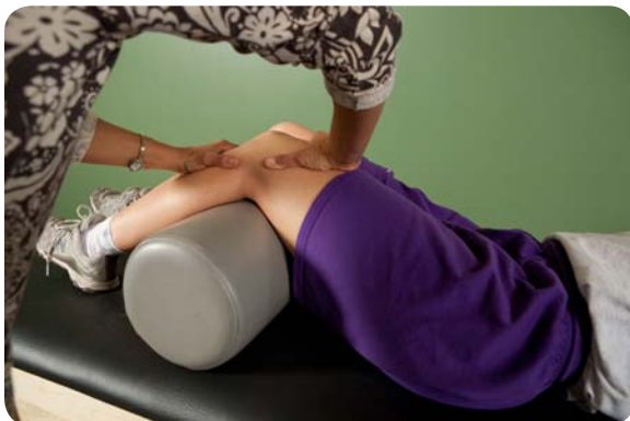
Stiffness dominant hip mobilization – grades III, IV