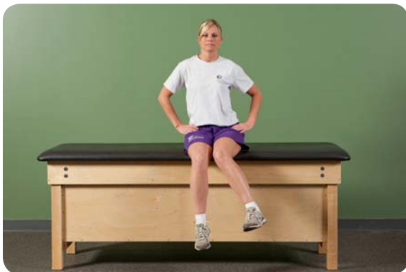
Weight shifts – anterior/posterior