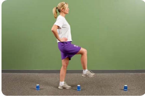
Forward walking over cups and hurdles (pause on affected limb), add ball toss while walking