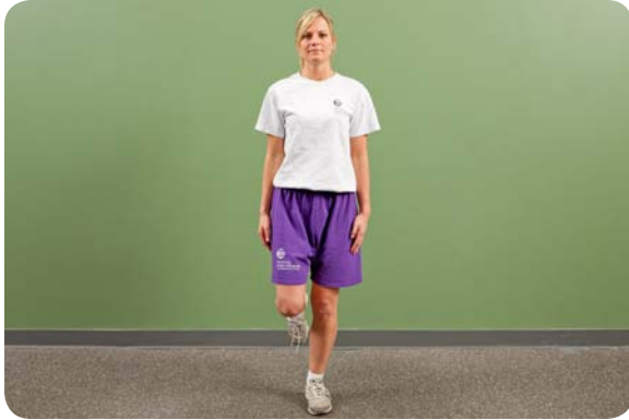
Single leg balance – firm to soft surface