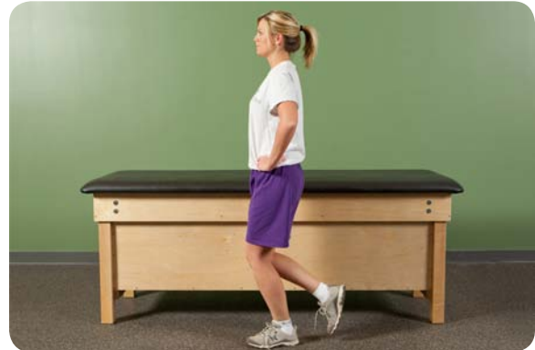
Single leg body weight squats, increase external resistance, stand on soft surface