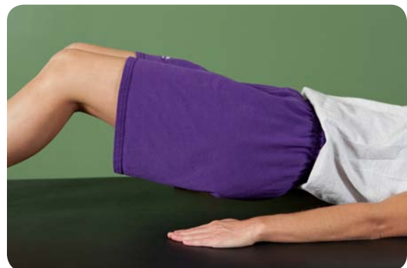
Double leg bridges