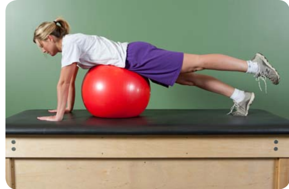
Superman on physioball – 2 point on physioball