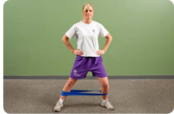
Sidestepping with resistance (pause on affected limb), sports cord walking forward and backward (pause on affected limb)