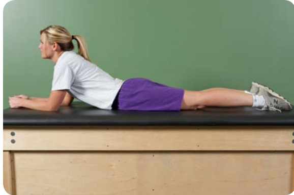
Prone on elbows