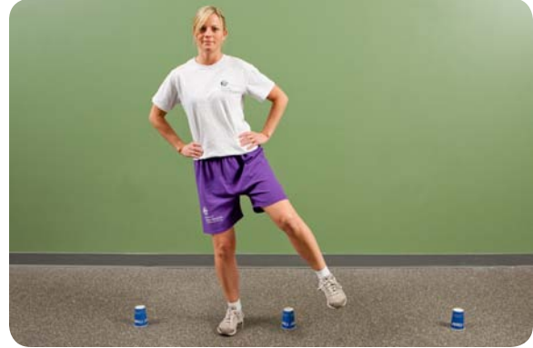
Side steps over cups/hurdles (with ball toss and external sports cord resistance), increase speed