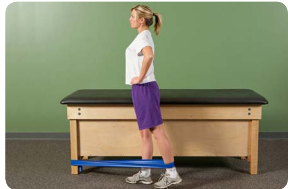
Theraband resistance on affected side – Extension (start very low resistance)