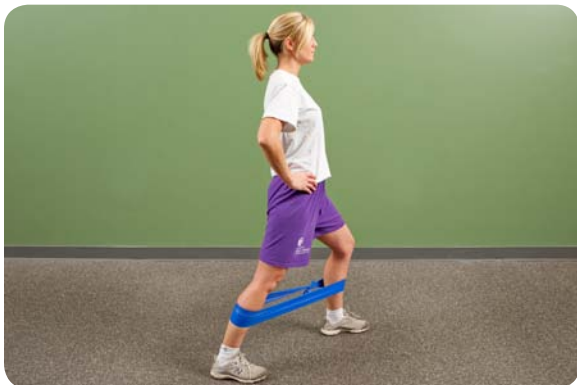
Theraband walking patterns – forward, sidestepping, carioca, monster steps, backward, ½ circles forward/backward – 25yds. Start band at knee height and progress to ankle height