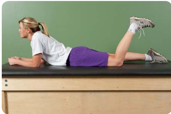
Prone knee flexion