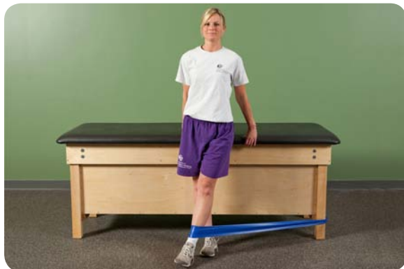
Theraband resistance on affected side – Adduction (start very low resistance)