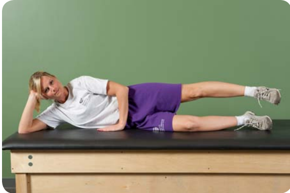
Leg raise – Abduction