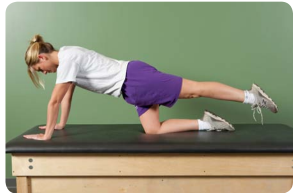
Quadruped 4 point support, progress 3 point support, progress 2 point