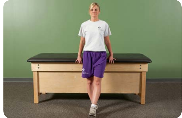
Standing adduction without resistance