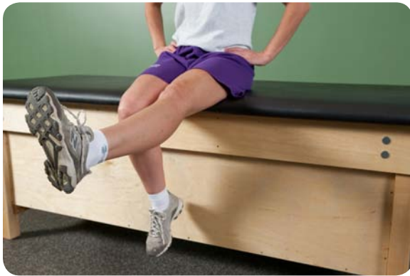
Seated knee extensions