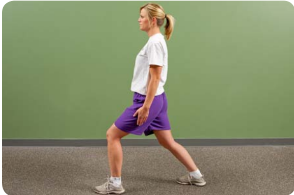
Lunges progress from single plane to tri-planar, add medicine balls for resistance and rotation