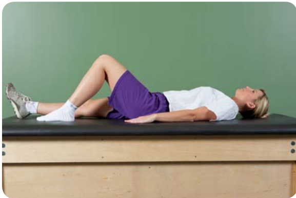
Heel slides, active-assisted range of motion