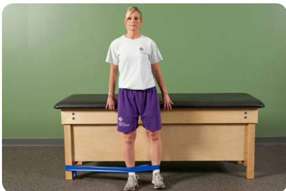
Standing theraband/pulley weight – Abduction