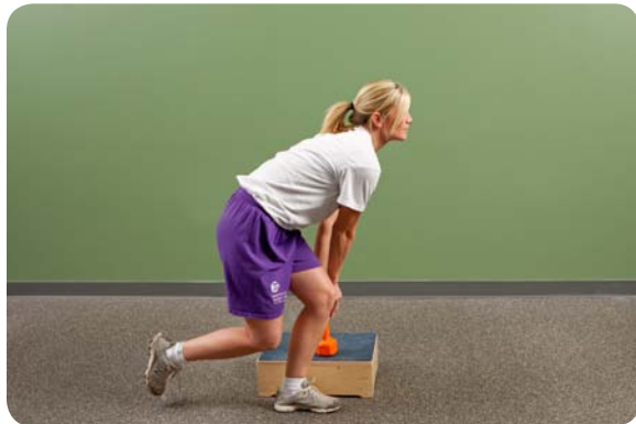
Single leg pick-ups, add soft surface