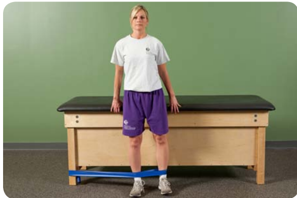
Theraband resistance on affected side – Abduction (start very low resistance)