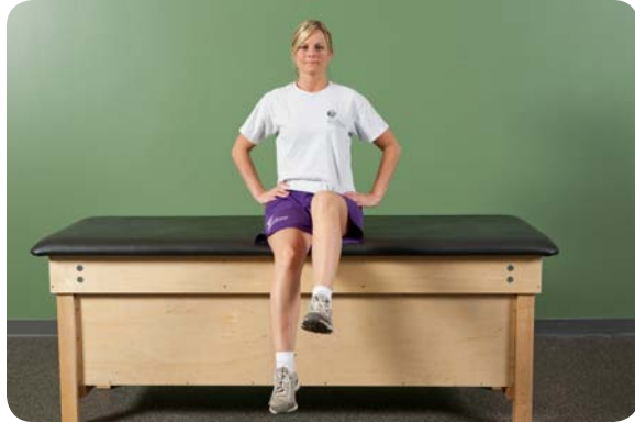
Hip flexion, IR/ER in pain-free range