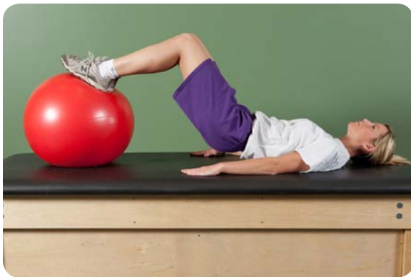
Physioball hamstring exercises – hip lift, bent knee hip lift, curls, balance