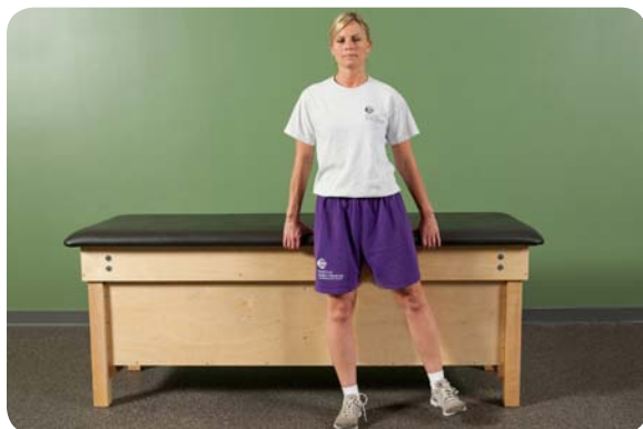
Standing abduction without resistance