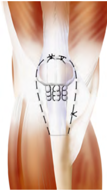
Figure 2. Front view of knee after patellar tendon repair. The primary sutures repair the torn tendon and the relaxing suture encompasses the repair and goes around the patella, providing initial protection to the repaired portion of the tendon.

Supervised and structured post-operative rehabilitation is an integral component to obtaining an optimal outcome. Research from our institution has shown that early rehabilitation and mobilization are safe and effective for maximizing outcome. 3 Our rehabilitation guidelines are presented in a criterion based progression program. General time frames are given for reference to the average, but individual patients will progress at different rates depending on their age, associated injuries, pre-injury health status, rehabilitation compliance, tissue quality, and injury severity. Specific time frames, restrictions and precautions may also be given to protect healing tissues, and the surgical repair/reconstruction.